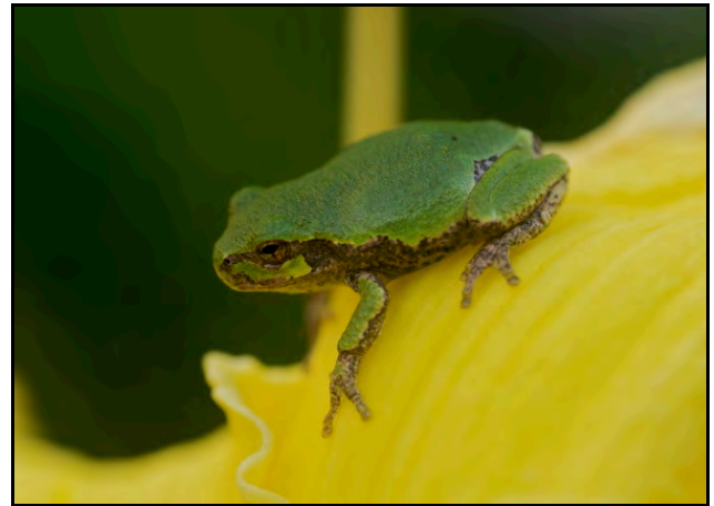
Gray Treefrog on flower

If you are a teacher, camp organizer, or anyone involved in a group that you think our programme could benefit please contact us at: aap@torotozoo.ca / 416-392-5999