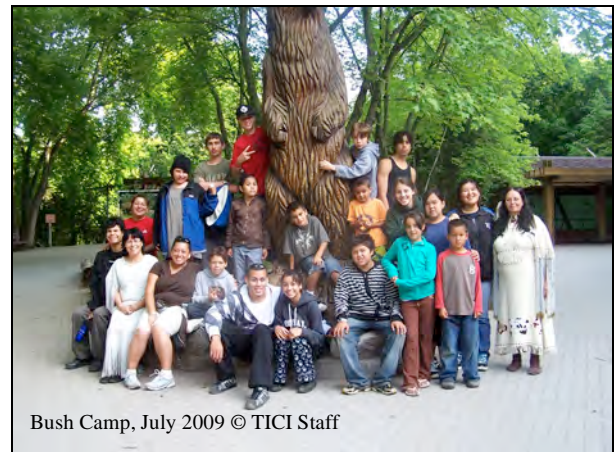
Bush Camp, July 2009

Turtle Island Conservation is a quickly changing program, with many new exciting activities and events on the horizon. Stay informed about upcoming events by visiting our website at www.turtleislandconservation.ca . Please email Kim Wheatley (TICI Coordinator) at turtleisland@torontozoo.ca if you have any inquiries!